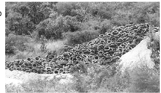
Illegally dumped tires

questioned the whereabouts of those disposed tires? How come... we, as consumers, have to pay a $3-$5 fee to dispose of worn tires and there has been no announcement that the businesses responsible for the dumping have been cited and fined? How come... there has not been some kind of color coding system put in to place which could be used to more easily identify those businesses which are dumping tires illegally? How come... someone can illegally dump tires and believe that they will profit and not get caught? How come... someone can illegally dump tires and not think that they are doing any damage to our island? Those tires are not only a horrid eye sore but a terrible fire hazard, and a breeding ground for mosquitoes and rats. How come... someone can be so self serving?