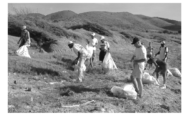
Members picking up trash at Spring Bay

The St. Croix Hiking Association participated in the Coast Week Beach Cleanup on September 24, 2005. Members and friends trekked to Spring Bay on the Gasperi Farm south shore property. There, three pickup trucks were filled with trash bags stuffed with refuse that had been thrown overboard by boaters and fishermen and garbage that had been carelessly left at the beach.