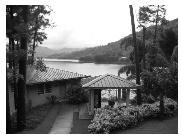
Hostal Villas del Lago