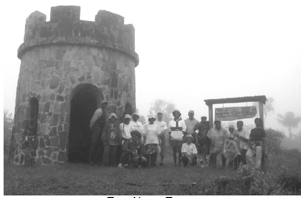
Toro Negro Tower